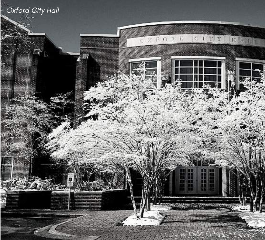
Oxford City Hall

Council of Governments OCTOBER 2021 NEWSLETTER