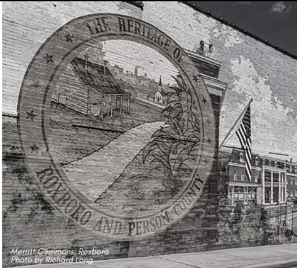
Merritt Commons, Roxboro