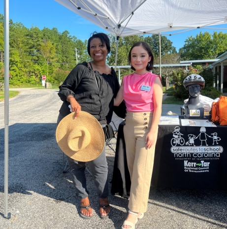
Back to School Bash w/ The Help Center NC