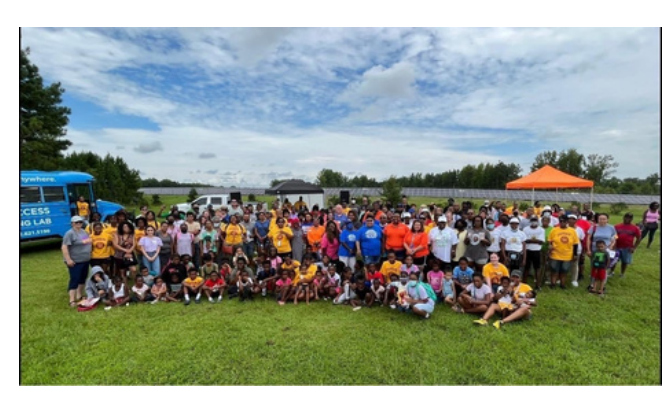
Turning Point CDC Community Day 2022

The Henderson Optimist Club extended a generous donation to the Kerr-Tar Regional Council of Governments to further Safe Routes to School endeavors in our region. Thank you so much to the Henderson Optimist Club for helping us further our Safe Routes to School impact!