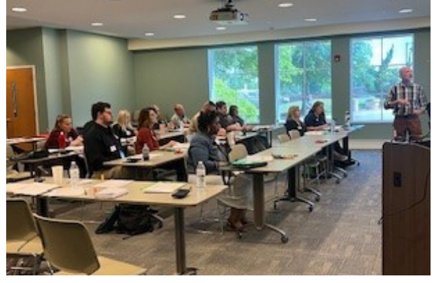
Butner Training Session